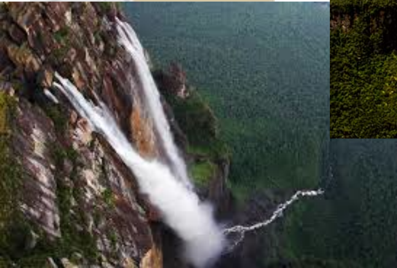
Angel Falls (Venezuela)