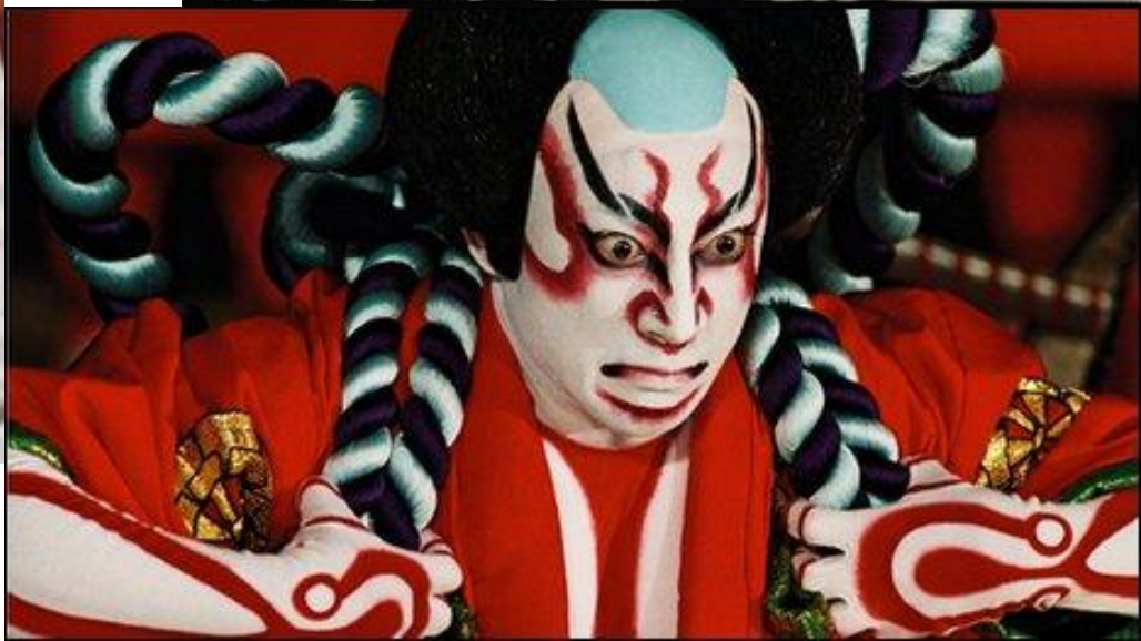
Kabuki comedy actors