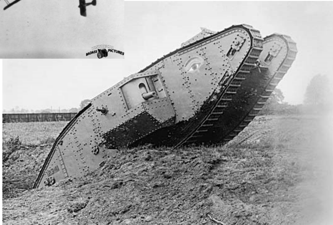
WWI tank crossing the trenches